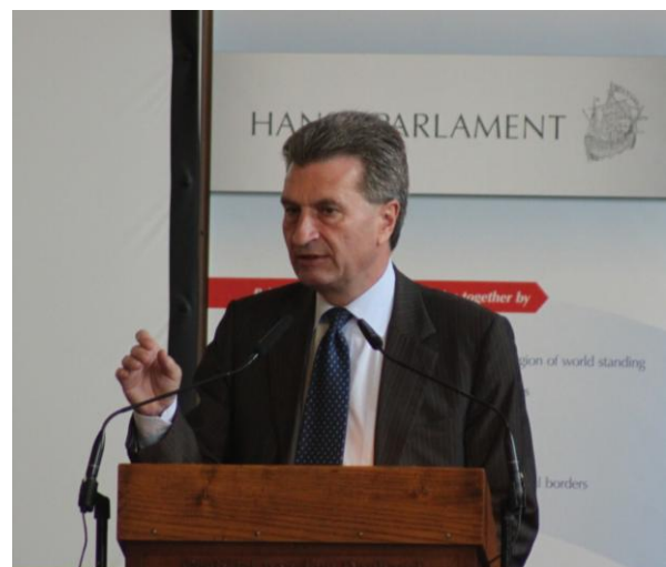
Photo 2: Günther Oettinger, the EU Commissioner for Energy at the Hanseatic Conference in Hamburg

Günther Oettinger, the EU Commissioner for Energy touched upon the importance of modernisation of old buildings at the Hanseatic Conference: "At present, modernisation of old buildings is more important than the construction of new energy-efficient houses." Here the potential of savings is much bigger and in view of that the amount of savings in new construction is trifling. Its generation leaves children large debts in the public portfolio. "That is why modernisation of old construction is the best form of generation justice" – said G. Oettinger.