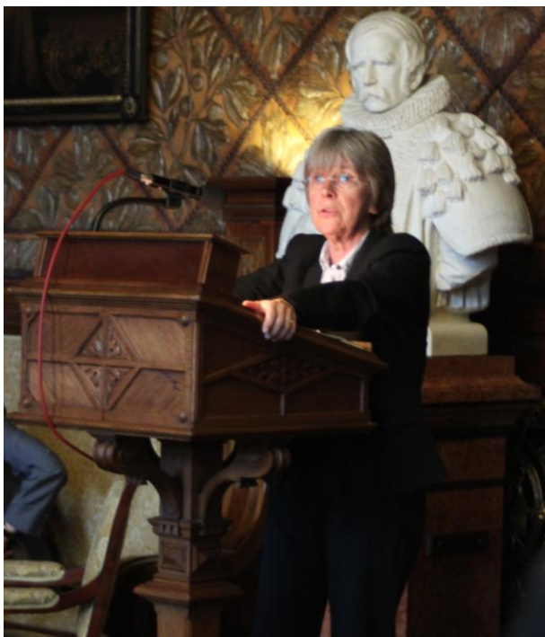
Photo 1: Reception at the Town Hall and meeting with Senator Jutta Blankau

Using this chance, the Office for Urban Development and Environmental Protection in Hamburg with the Baltic Sea Academy and the Hanseatic Parliament organised in Hamburg and international conference concerning energy efficiency and climate protection within the Baltic Sea Region from 11-13 May 2011.