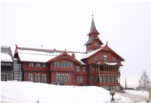
Photo: Our conference hotel in Holmenkollen in Oslo

On 11 February in Oslo also the final workshop concerning the project "European Regions for Innovative Productivity (ERIP)" took place. This project, which was conducted in the North Sea Region, runs very successfully. As regards lean management, increasing innovations with significant cost reductions could be achieved for small and medium-sized enterprises. The Hanseatic Parliament is a Project Partner and has transferred its most important results to the Baltic Sea Region.