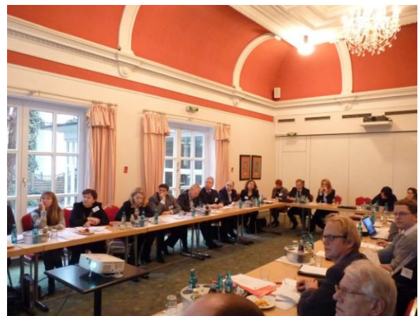
Photo: Meeting of the Baltic Sea Academy on 10 January 2011 in Hamburg

On 10 January 2011 a General Meeting of the Baltic Sea Academy took place. The subsequent workshop was devoted to enterprise consultations concerning the promotion of innovations which should be carried out by the Hanseatic Academy of Management in Słupsk (see below). In addition, proposals of new projects have been developed intensively and these proposals should be submitted in 2011.